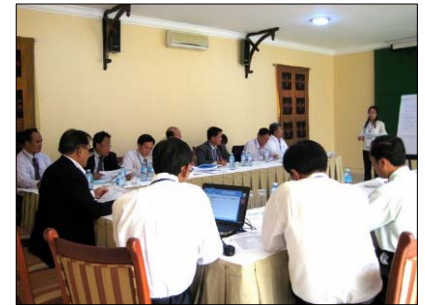
Participants from the 2 nd Cross-Border Workshop between Cambodia, China PR, Lao PDR and Vietnam.

human and animal health professionals, from central and local levels, international organizations (WHO, FAO), etc. For instance, the 2 nd cross-border workshop in Siem Reap (Feb. 2009) led to 3-year cross-border plans among Cambodia, China, Lao PDR and Vietnam. In an effort to encourage donors’ coordination, all these above cross-border events have been co-sponsored by the GMS CDC project and the USAID (through Kenan Institute Asia). The Regional Coordination Unit is also mapping the various cross-border activities already undertaken by various partners in the subregion.