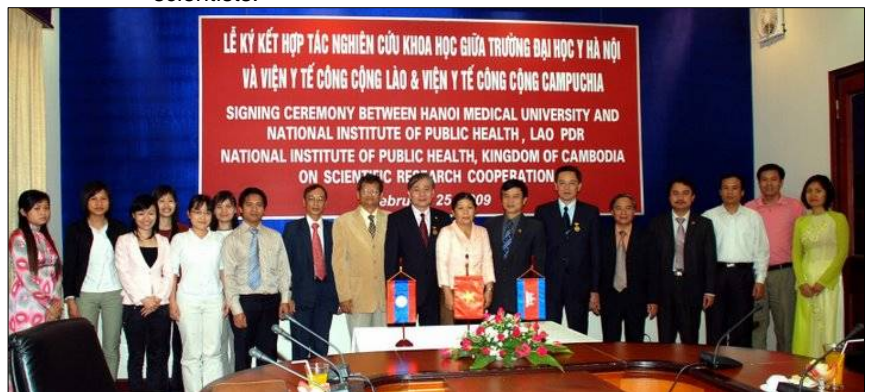
Signing ceremony of a GMS CDC-supported agreement on scientific research cooperation between Hanoi Medical University, the Lao PDR National Institute of Public Health and the Cambodian Institute of Public Health, on 25 February 2009 in Hanoi, Vietnam.

Linkages between Mekong countries' research institutions are critical to develop collaboration, yet the former are either inexistent or very weak. The GMS CDC project promotes these linkages while addressing also the need for evidence base in operations by supporting Joint Regional Small Scale Operational Studies : Mekong countries after prioritizing -- each country individually -- which operational research studies they need in communicable diseases, meet and agree on a joint research prioritization, and finally on conducting studies jointly, after a strict “joint proposal” selection procedure. Two joint regional research studies have already been signed and started and two more are expected before the end of the project. The procedure, although extremely time-consuming, has already led to the signing of “scientific collaboration agreement” among CLV countries, and to now regular face-to-face or electronic exchanges among CLV countries scientists.